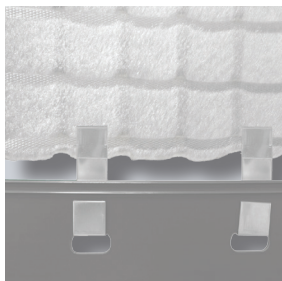
ND Erosion Protection Profile

The ND Erosion Protection Profile is a rigid plastic profile with a construction height of approx. 45 mm. The profile has punched, slotted holes for fixing the ND Erosion Protection Profile with the ND Fixing Clip to the ND ESG-40/40 Erosion Protection Grid. The profile will hold the ND SM-50 Substrate Panels in place.